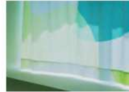
②Hall Lunch Room