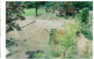
④Tree House ⑤Tsukimi-yama (play mound) ⑥Biotope