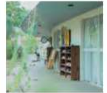
③Open-plan (Nursing Room)